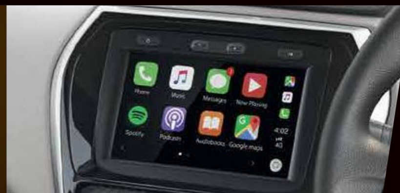
7.0 Touchscreen with Advanced Infotainment System