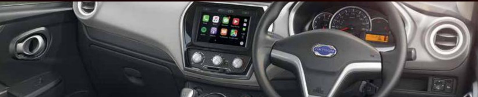
Dual Tone Premium Interiors

We know what you need in your car. And have designed accordingly.