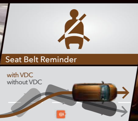
Seat Belt Reminder