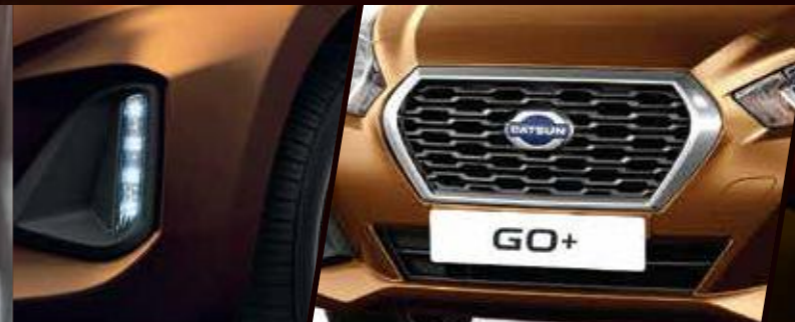
Stylish LED DRLs