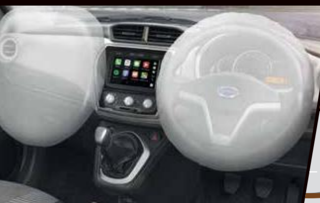
Dual Front Air-Bags

Make every drive a safe drive. The Datsun GO+ is packed with next generation safety features to keep you and your loved ones safe.