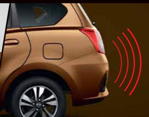
Reverse Parking Sensor