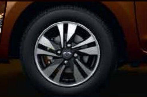
Diamond-cut R14 Alloys