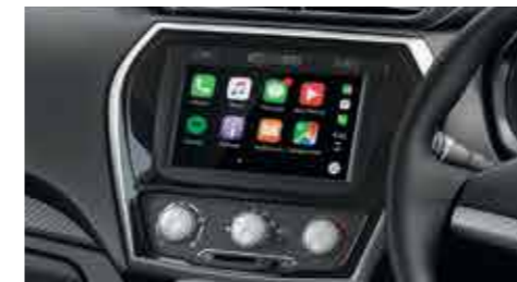
17.64cm (7.0) Touchscreen with Advanced Infotainment System

SMART We know what you need in your car. And have designed it accordingly.