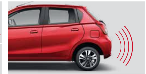
Reverse Parking Sensor

SMART We know what you need in your car. And have designed it accordingly.