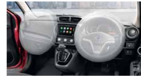
Dual Front Airbags

SAFE Make every drive a safe drive. The Datsun GO CVT is packed with next-generation safety features.