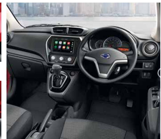
All-Black Premium Interiors