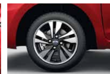
Diamond-Cut R14 Alloys