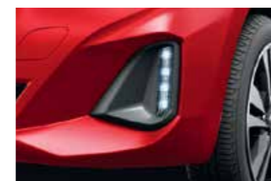
Stylish LED DRLs

STYLE Turn heads on the road with a dazzling range of new generation features.