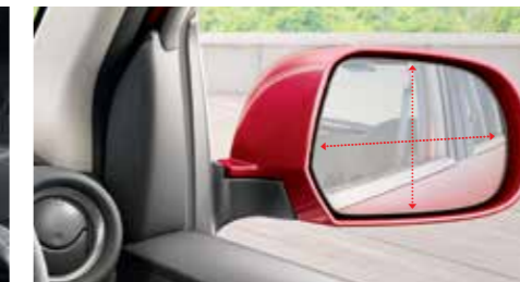
Electric Adjustable ORVMs