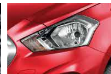
Headlamps with Follow-Me-Home Feature